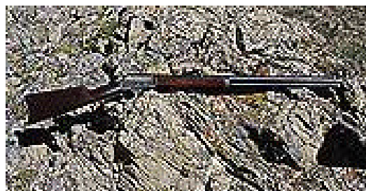
Mike's Marlin Model 1894 has a 24-inch round barrel, a full-length magazine tube, straight-grip buttstock with crescent-shaped steel buttplate, a steel-capped forend, bead front sight and buckhorn rear sight, and is chambered in .44-40.

NOTES: The Marlin Model 94 used to obtain these results had a 24-inch barrel and was manufactured sometime between 1905 and 1910. Accuracy is for one 10-shot group fired from sandbag benchrest at 25 yards. Velocity is the average of 10 rounds measured six feet from the gun's muzzle. The handload used Starline brass and Winchester Large Pistol primers. Bullets were cast of 1:20 tin-to-lead alloy, sized .428 inch, and lubed with SPG.