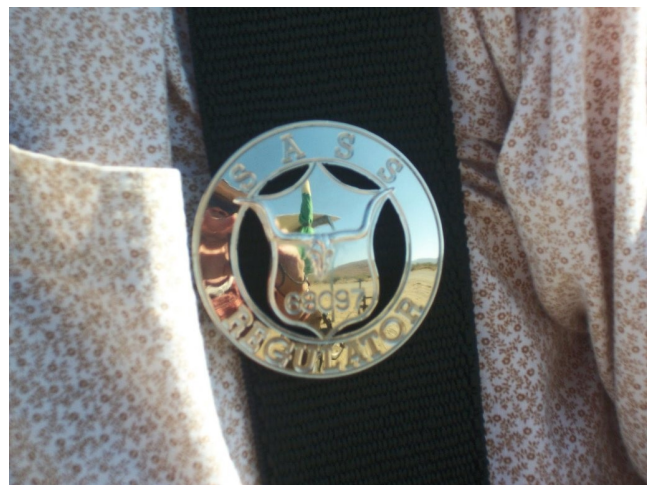
It looks like it belongs there.